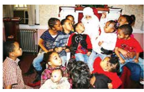
Get details on this year's Santa Open House on page 1.

the WCDC and Casey Droege Cultural Productions presents