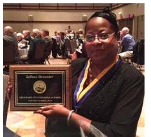
Alexander when she was inducted into the Hall of Fame.

A FREE COMMUNITY NEWSLETTER BRINGING YOU GOOD NEWS ABOUT WILKINSBURG