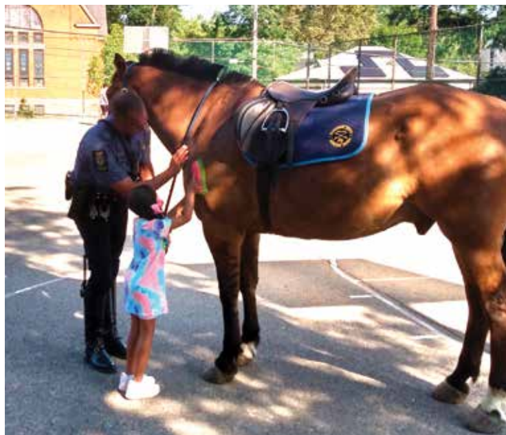
The Summer Recreation program at Ferguson Park, sponsored by Borough council and school board, ended August 11 with face painting and pizza by Salvatore's Pizza House. Activities over the Summer included science programs from Pitt, CMU, ALCOSAN; a fire truck and county police horse visit; participatory dance from Attack Theatre; pogo from XPOGO; and more. Special thanks to donors Wilkinsburg Beverage, CSMckee, and Salvatore's.

Ceramic Painting, Sept. 16, all day—Paint ceramic piece to take home.