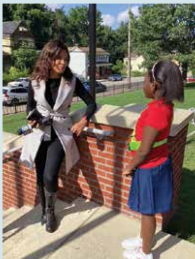
A student being interviewed by the press