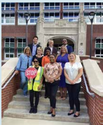
PennDOT, AAA dignitaries, and staff from the Wilkinsburg School District.