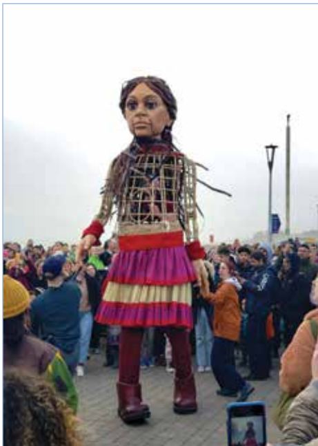
Little Amal walks in Brighton, England.